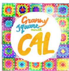
Square 8 - @Lottieandalbert